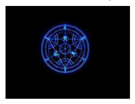
~ Step 2: knowledge for the Transmutation in the process of transformation ~

Video: <a href="http://www.voutube.com/watch?v=BnBcsO3vIx4&feature=voutu.be">http://www.voutube.com/watch?v=BnBcsO3vIx4&feature=voutu.be</a>