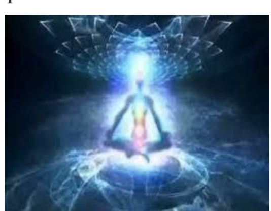
~ Step 3 of the Process of Transformation ~

In order to achieve a Transmutation, everything has to be brought to zero point. Zero point means no charge. And than we begin the last final step towards Transformation, which implies the knowledge of Transformation.